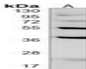
Western blot analysis of CD273 expression in Nontransfected 293T (A), Transfected PDL2transfected 293T (B) whole cell lysates.