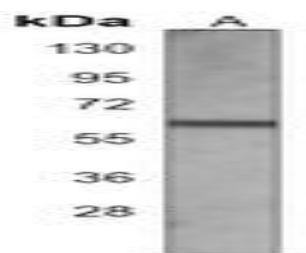
Western blot analysis of ERK7 expression in MCF7 (A) whole cell lysates.