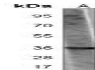
Western blot analysis of MYO18B expression in recombinant protein (A) whole cell lysates.