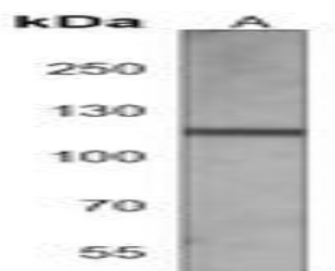
Western blot analysis of CD167a expression in MCF7 (A) whole cell lysates.