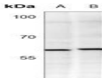
Western blot analysis of YY1 expression in 293 (A), C6 (B), HeLa (C), U251 MG (D) whole cell lysates.