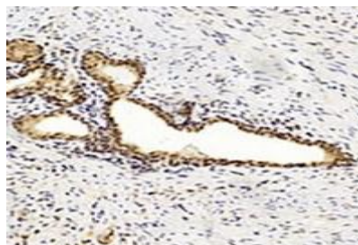
Immunohistochemical analysis of MGMT staining in human prostate cancer formalin fixed paraffin embedded tissue section. The section was pre-treated using heat mediated antigen retrieval with sodium citrate buffer (pH 6.0). The section was then incubated with the antibody at room temperature and detected using an HRP conjugated compact polymer system. DAB was used as the chromogen. The section was then counterstained with haematoxylin and mounted with DPX.