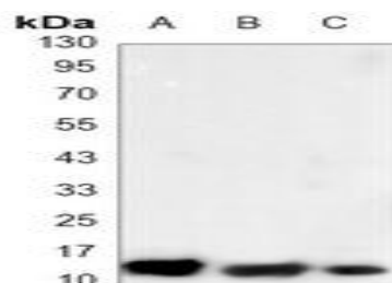
Western blot analysis of S100-A10 expression in C6 (A), NIH3T3 (B), HeLa (C) whole cell lysates.