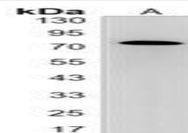
Western blot analysis of GRP78 expression in C6 (A) whole cell lysates.