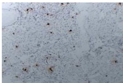
Immunohistochemical analysis of Tryptase alpha/beta staining in human

uterus formalin fixed paraffin embedded tissue section. The section was pre-treated using heat mediated antigen retrieval with sodium citrate buffer (pH 6.0). The section was then incubated with the antibody at room temperature and detected using an HRP conjugated compact polymer system. DAB was used as the chromogen. The section was then counterstained with haematoxylin and mounted with DPX.