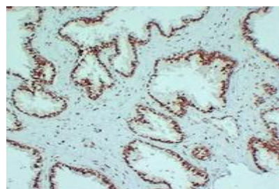
Immunohistochemical analysis of Androgen Receptor staining in human prostatic carcinoma formalin fixed paraffin embedded tissue section. The section was pre-treated using heat mediated antigen retrieval with sodium citrate buffer (pH 6.0). The section was then incubated with the antibody at room temperature and detected using an HRP conjugated compact polymer system. DAB was used as the chromogen. The section