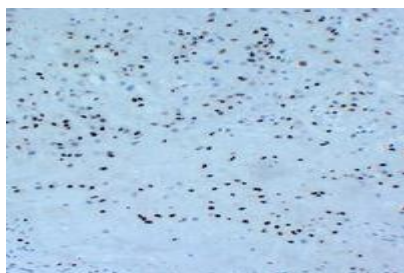
Immunohistochemical analysis of p57 Kip2 staining in human placenta

formalin fixed paraffin embedded tissue section. The section was pre-treated using heat mediated antigen retrieval with sodium citrate buffer (pH 6.0). The section was then incubated with the antibody at room temperature and detected using an HRP conjugated compact polymer system. DAB was used as the chromogen. The section was then counterstained with haematoxylin and mounted with DPX.