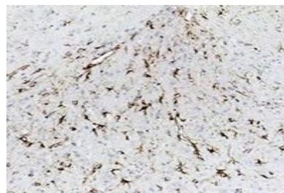
Immunohistochemical analysis of GFAP staining in rat brain formalin fixed paraffin embedded tissue section. The section was pre-treated using heat mediated antigen retrieval with sodium citrate buffer (pH 6.0). The section was then incubated with the antibody at room temperature and detected using an HRP conjugated compact polymer system. DAB was used as the chromogen. The section was then counterstained with haematoxylin and mounted with DPX.