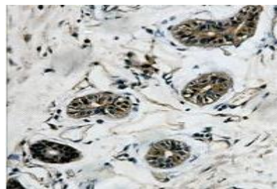
Immunohistochemical analysis of Beta-tubulin staining in human colon formalin fixed paraffin embedded tissue section. The section was pre-treated using heat mediated antigen retrieval with sodium citrate buffer (pH 6.0). The section was then incubated with the antibody at room temperature and detected using an HRP conjugated compact polymer system. DAB was used as the chromogen. The section was then counterstained with haematoxylin and mounted with DPX.