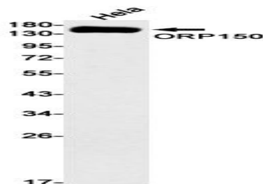
Western blot analysis of ORP150 in HeLa lysates using ORP150 antibody.