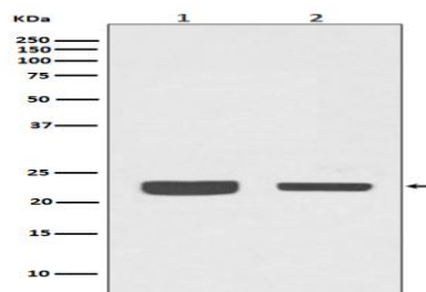
Western blot analysis of RAB7 in A375 lysates; 3T3 lysates using Rab7 antibody.