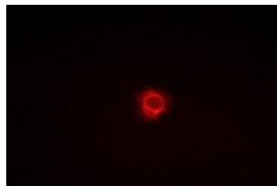
Immunofluorescent analysis of GPR108 staining in HuvEc cells. Formalin-fixed cells were permeabilized with 0.1% Triton X-100 in TBS for 5-10 minutes and blocked with 3% BSA-PBS for 30 minutes at room temperature. Cells were probed with the primary antibody in 3% BSA-PBS and incubated overnight at 4 °C in a humidified chamber. Cells were washed with PBST and incubated with a AF594-conjugated secondary antibody (red) in PBS at room temperature in the dark.