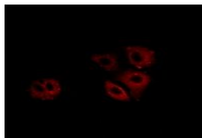
Immunofluorescent analysis of CCR10 staining in A549 cells. Formalin-fixed cells were permeabilized with 0.1% Triton X-100 in TBS for 5-10 minutes and blocked with 3% BSA-PBS for 30 minutes at room temperature. Cells were probed with the primary antibody in 3% BSA-PBS and incubated overnight at 4 °C in a humidified chamber. Cells were washed with PBST and incubated with a AF594-conjugated secondary antibody (red) in PBS at room temperature in the dark.