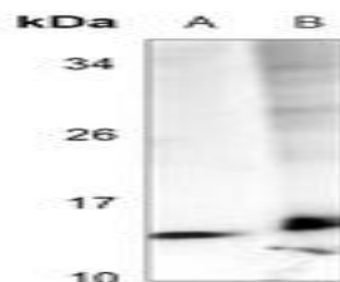
Western blot analysis of BRP44 expression in rat kidney (A), mouse liver (B) whole cell lysates.