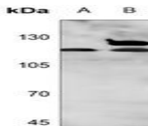
Western blot analysis of Androgen Receptor expression in A549 (A), H1792 (B) whole cell lysates.