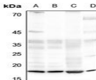
Western blot analysis of Histone H4 expression in HEK293T (A), Raw264.7 (B), rat thymus (C), mouse brain (D) whole cell lysates.