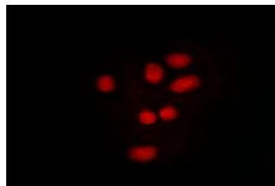
Immunofluorescent analysis of PRDM12 staining in HepG2 cells. Formalin-fixed cells were permeabilized with 0.1% Triton X-100 in TBS for 5-10 minutes and blocked with 3% BSA-PBS for 30 minutes at room temperature. Cells were probed with the primary antibody in 3% BSA-PBS and incubated overnight at 4 °C in a humidified chamber. Cells were washed with PBST and incubated with a AF594-conjugated secondary antibody (red) in PBS at room temperature in the dark.