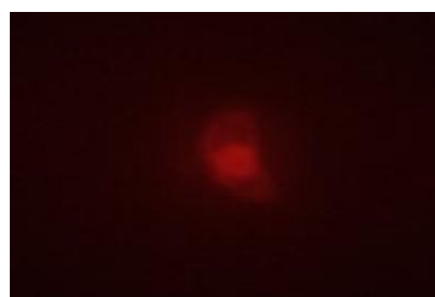
Immunofluorescent analysis of BRSK1 staining in HeLa cells. Formalin-fixed cells were permeabilized with 0.1% Triton X-100 in TBS for 5-10 minutes and blocked with 3% BSA-PBS for 30 minutes at room temperature. Cells were probed with the primary antibody in 3% BSA-PBS and incubated overnight at 4 °C in a humidified chamber. Cells were washed with PBST and incubated with a AF594-conjugated secondary antibody (red) in PBS at room temperature in the dark.