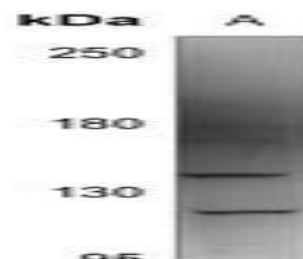
Western blot analysis of AAK1 expression in HeLa (A) whole cell lysates.